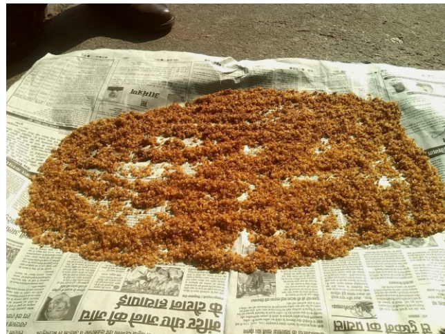
Fig. 15: Drying of washed sample in ambient air