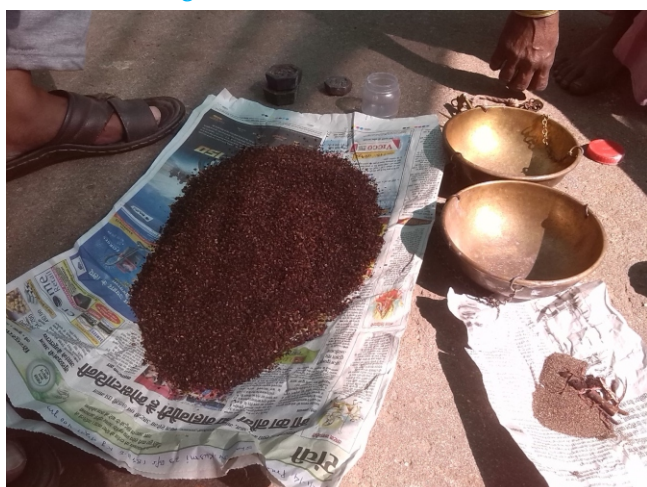
Fig.10: Sample for washing and rejected wood, dust etc