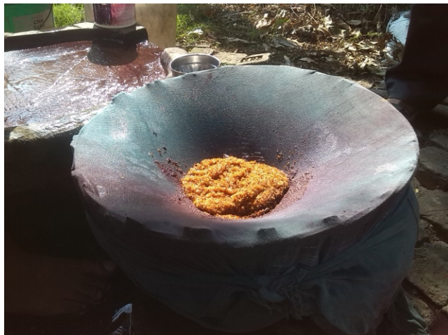
Fig. 14: Washed grain of seedlac

precisely dealing with resin content in raw material which can be estimated in a lab through lab/chemical process. Apart from this since this is manual process so the result may vary from person to person who is determining chouri-parta . Now a days there is also shortage in such type of neutral person in this type of industry who earlier used to work for such activity and acceptable to both buyer and seller and chouri-parta in that places is now determined by processor itself on which supplier has to rely and trust on them. In most of places although chouri-parta is determined based on golden seedlac but fact is that for actual processing in most lac processing units, raw material is mostly converted into normal grade with impurity content varying from 3 to 5% suitable for further most of application like making of lac based products shellac, bleached lac etc.