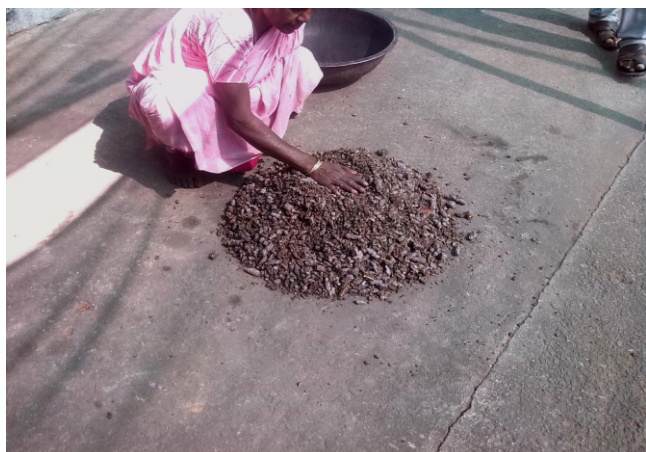
Fig. 3: Mixing and spreading of samples in circular shape

Samples thus collected are mixed (Fig.3) on cemented floor and spread in circular shape of 3" height approx and divided in four equal parts. Out of four only two opposite parts are taken for further sampling. Remaining two opposite parts are discarded (Fig.4).