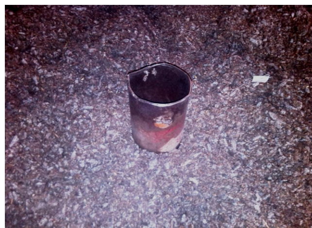
Fig. 1: Sample picker