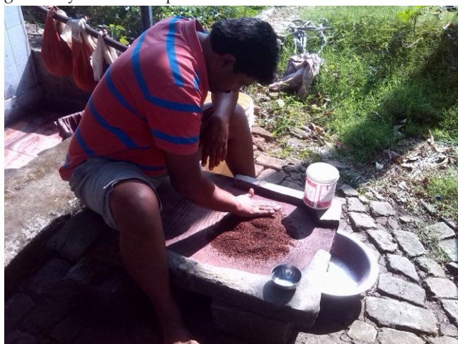
Fig. 11: Sample on washing stone

The 8-40 mesh size crushed sample prepared above is washed manually for preparing golden seedlac (impurity-2% maximum) through golden washing by rubbing wet lac grains by hand on special horizontal stone made for this