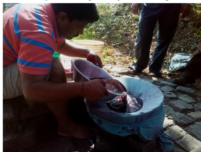
Fig. 13: Separation of washed lac and dye enriched water

(Fig.11). Sticklac grain is washed two times with water by rubbing on stone by hand to get colour lighter without addition of soda (Fig.12). The impurity content at this stage may be approximately 3%. Now soda is added in quantity 0.4-0.5% by wt. of sticklac and rubbed and washed with water to get golden colour seedlac. A mark in cloth is used to separate washed seedlac and dye enriched wash water in each successive washing (Fig.13).