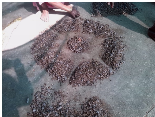
Fig. 6: Collected stick lac at centre for final samples

One sample of 400-500 gm size is weighted and it is screened through 40 mesh screen to remove sand and dust. It is then crushed using stone ( loda ) (Fig.8) and after each pass of