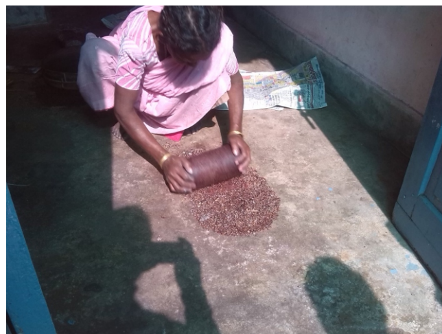
Fig. 8: Crushing of sticklac

crushing it is screened through 8 mesh size screen and crushed sample of 8-40 mesh size thus collected is used for subsequent processing (Fig.9). Rejected dust and wood particles/items above 8 mesh size is also kept separately for proof or record (Fig.10).