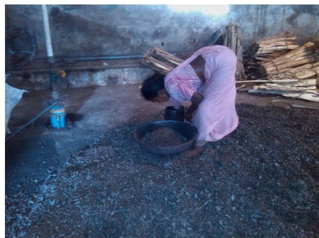
Fig.2: Collection of samples through Sample picker