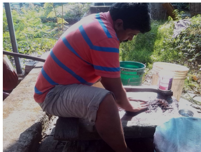
Fig. 12: Washing of lac by hand rubbing