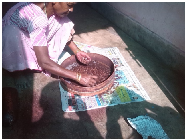
Fig. 9: Removal of wood & dust