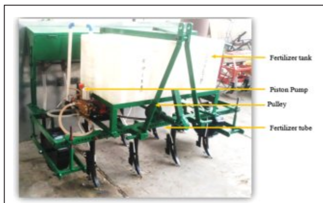
Fig. 2 Developed Liquid Fertilizer applicator