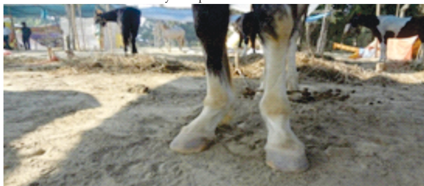
Fig 1: Toe-out abnormal conformation in the forelimb of horse

Out of 11 horses having abnormal conformation, the forelimb of two horses was having toe-out abnormal conformation. This conformation was noticed by viewing horse from the front side. In this conformation, toes were pointed away from one another and base narrow condition was observed which was one of the worst conformations of the forelimb. This finding validates the findings of Adams (1974), which suggested that the limb might be crooked as high as its origin at the chest or as low as the fetlock down. It was usually accompanied by base-narrow conformation but rarely was present when the horses were base-wide. In