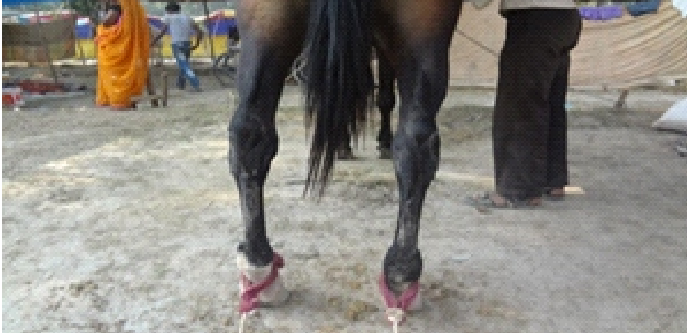
Fig 4: Bowleg abnormal conformation in hind limb of horse

it was observed that it did not bisect the limb. These horses were base wide as far as hocks and base narrow from hocks down. These findings collaborate with the observations of Halmstrom et al. , (1995); (Fig 4).