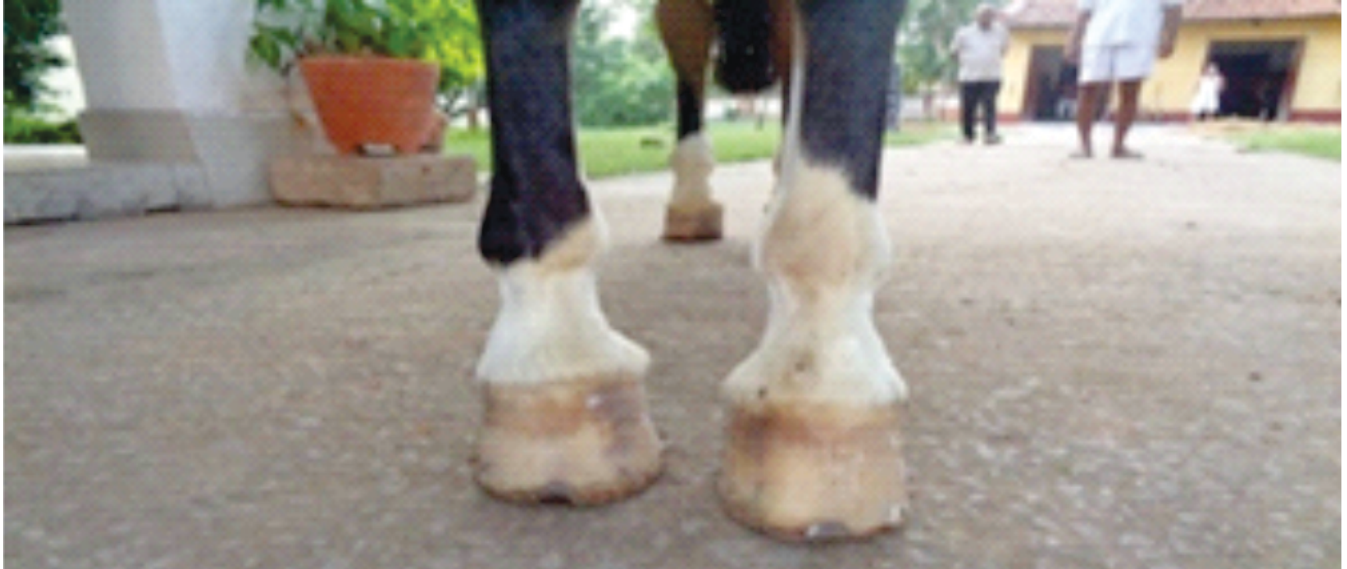
Fig 2: Toe-in abnormal conformation in Forelimb Of horse

Another abnormal conformation detected was a toe in. It was present in one out of eleven horses having abnormal conformation. The horses when viewed from the front had